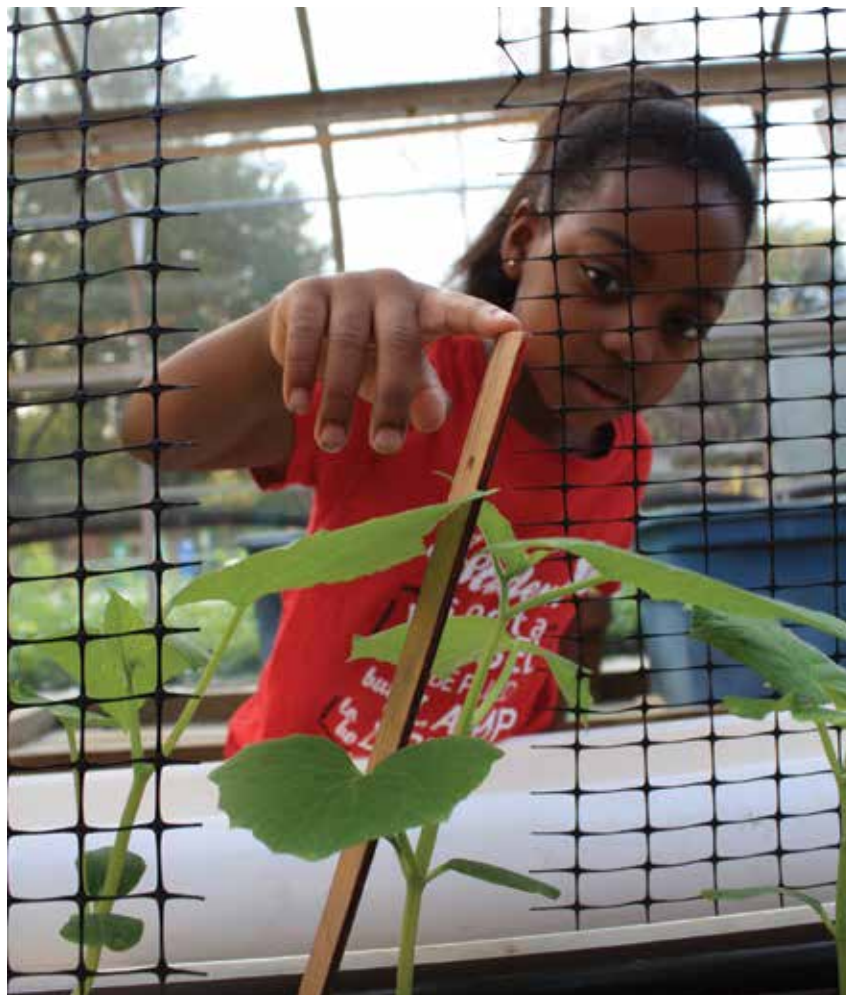
Measuring cucumber plant growth

Students learned the importance of agriculture and how its contributions to our country’s history, geography, economics, government, and culture. At the end of the pioneer unit, students gathered around the campfire (the school has built-in fireplaces) and celebrated with homemade pickles.