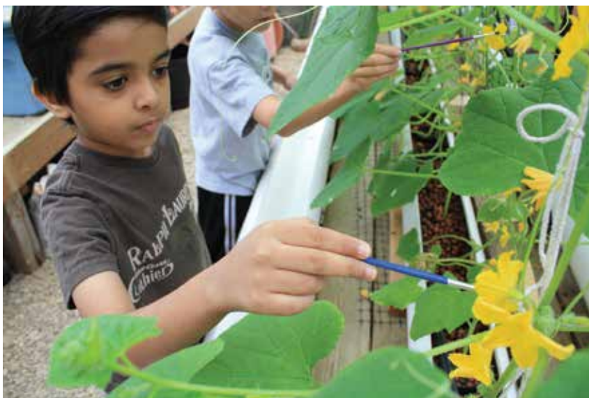
Pollinating cucumbers with a paintbrush

Crosscutting Concept: Structure and Function). One student asked, “What about our plants? How will they get pollinated if they’re inside?” Great question! (NGSS Disciplinary Core Idea: LS2.A Interdependent Relationships in Ecosystems: Plants depend on animals for pollination or to move their seeds around).