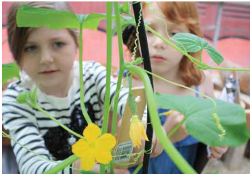
Measuring cucumber fruit and flowers

Once the plants had sprouted, students transplanted seedlings to the hydroponics system in the school’s greenhouse. While there, students were introduced to the parts and functions of the hydroponics system. We noted that there was no soil. However, plants do need something that’s found in soil—nutrients. Students were shown the nutrient solution used to supplement the water in the reservoir. One student asked, “So plants need nutrients just like