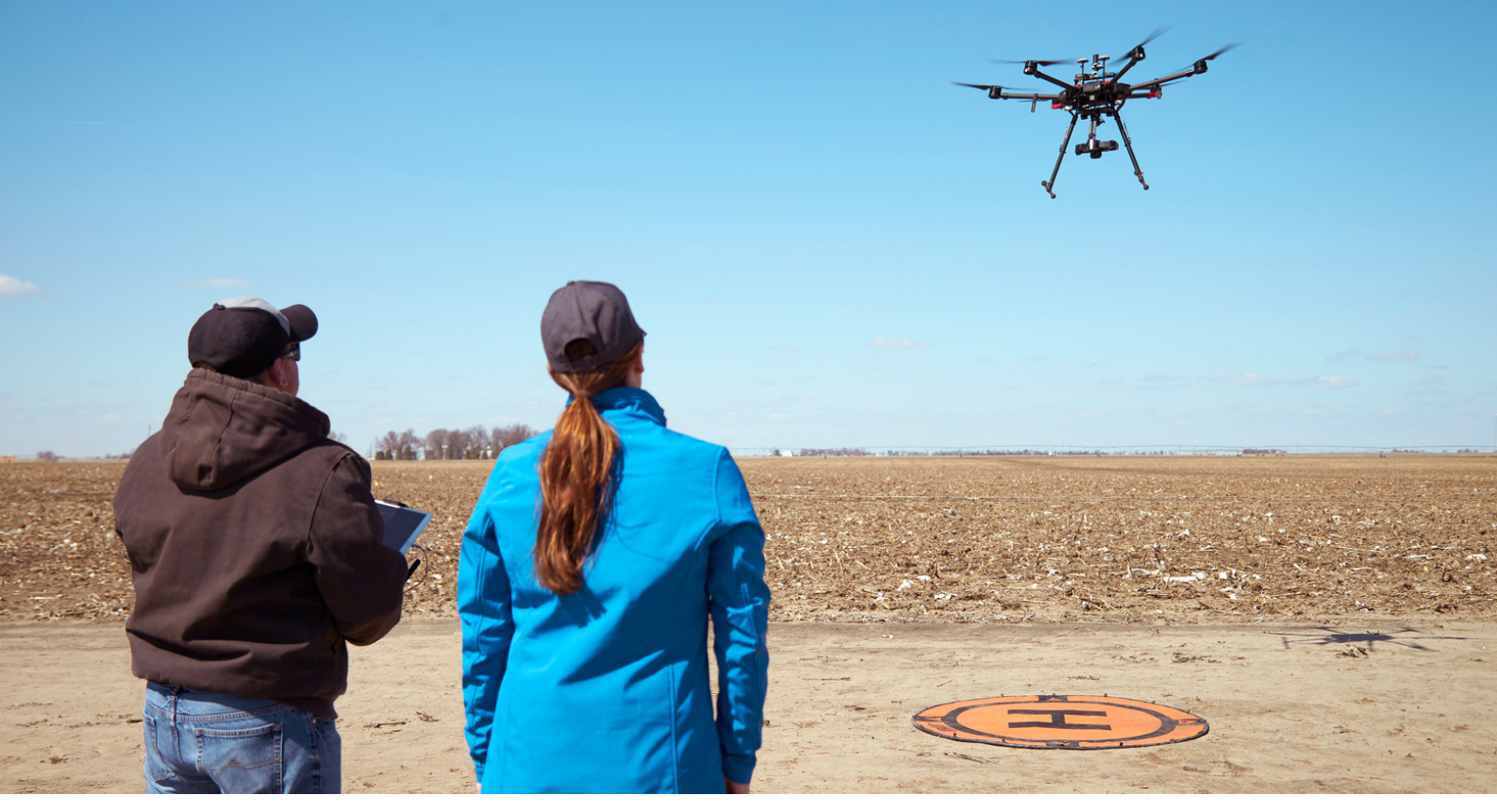
Figure 5: Corteva researchers undertaking geospatial observations using a drone