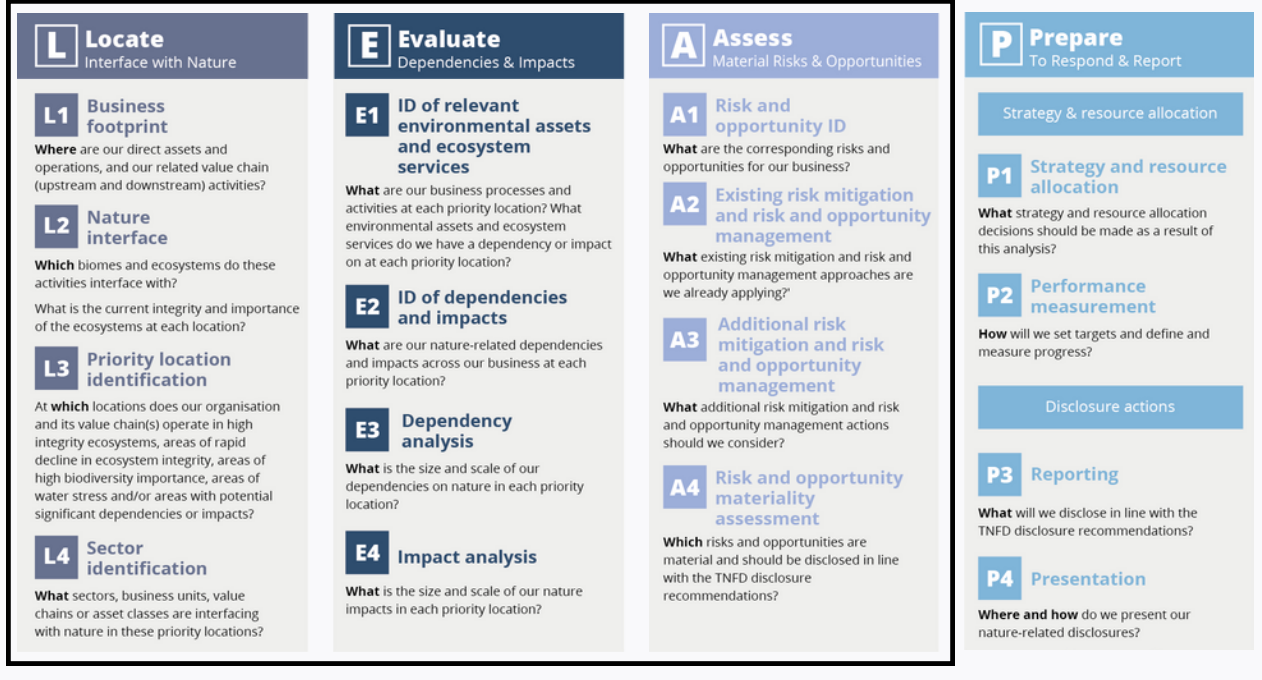
Figure 1: This case study focuses on the Locate phase and provides highlights of two issues in the Evaluate and Assess phases of the TNFD LEAP framework. Image adapted from <u>TNFD guidance</u>