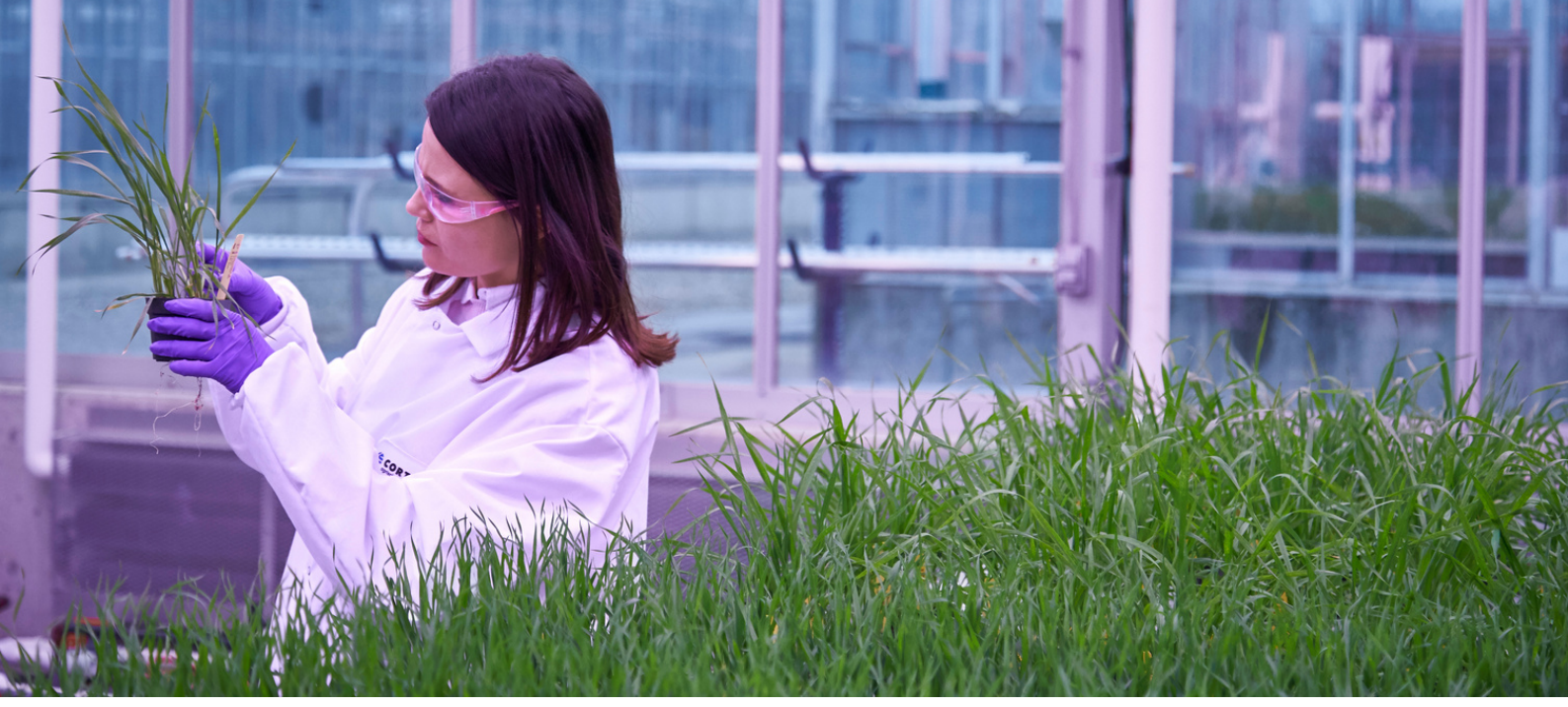
Figure 2: A Corteva research and development lab with greenhouse

segment was also chosen for its scalability, as pilot insights can be applied to the entire segment using Corteva's standardized data collection processes.