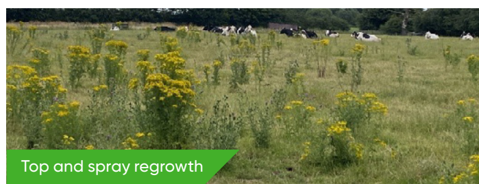
Top and spray regrowth