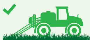
Spray grazing grass only.