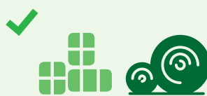
If manure is collected, it can be spread onto grass only.