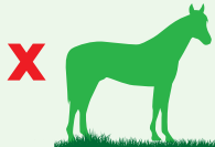
NOT to be grazed by horses or other animals.