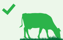
Must be grazed by cattle or sheep only.