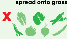
Do NOT use collected manure on other crops.