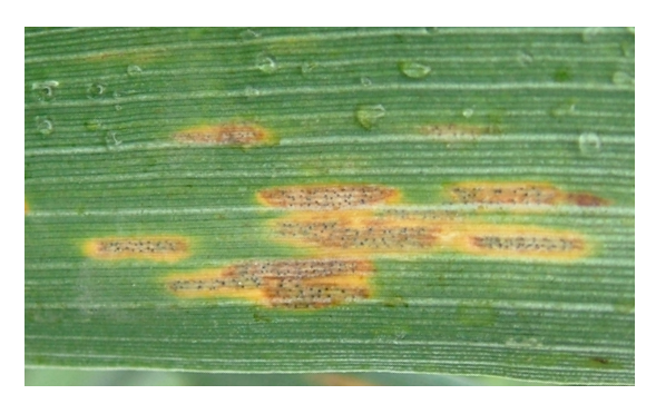
Septoria tritici, S. leaf spot