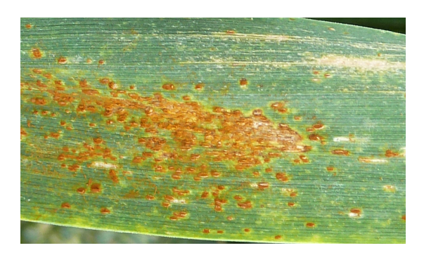
Puccinia recondita, Brown rust