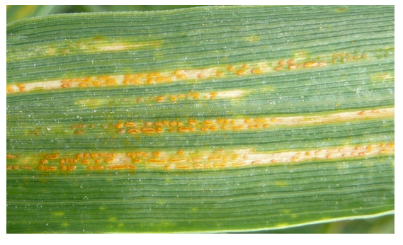
Puccinia striiformis, Yellow rust