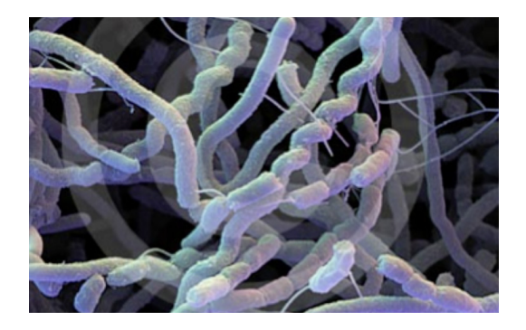
Streptomyces sp. 517-02 – the source of Inatreq

Inatreq is derived from a natural product, UK-2A, produced by a soil borne Streptomyces species belonging to the phylum Actinobacteria. The original strain was isolated from a soil sample collected at Osaka University in Japan.